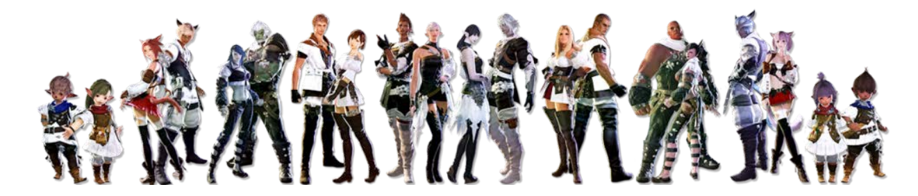
Left to Right. Plainsfolk Lalafell, Sun Miqo'te, Sea Wolves Roegadyn, Midlander Hyur, Wildwood Elezen, Duskwight Elezen, Highlander Hyur, Hellsguard Roegadyn, Moon Miqo'te, Dunesfolk Lalafell

The virtual world of Final Fantasy XIV is has magic naturally occurs in the world and is used for healing and fighting. People interacted with the world through characters they create known as player characters or avatars. These avatars can be male or female and a selection of races including human like Hyur, Elezen which are like tradition fantasy elves, cat like people called Miqo'te, fantasy dwarves called Lalafell, a giant race called Roegadyn, and a race related to fantasy dragons called Au Ra. Each race has different styles depending on where they come from in the world. "Avatars are viewed as a social representation of the player in the space and create a sense of presence in the world by locating the player" (Hutchinson 91).